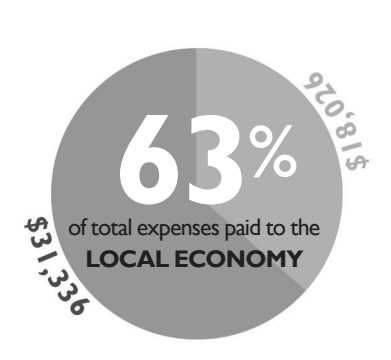
When dollars remain, dollars return.